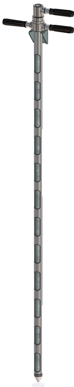
Duralumin and galvanized steel tubes probe. No internal divisions and opening system in three stages.