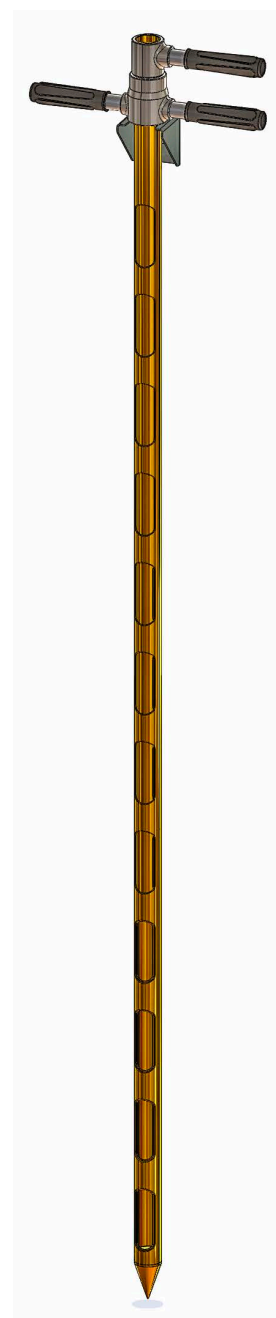
Double brass tubes probe. No internal divisions and opening system in three stages.